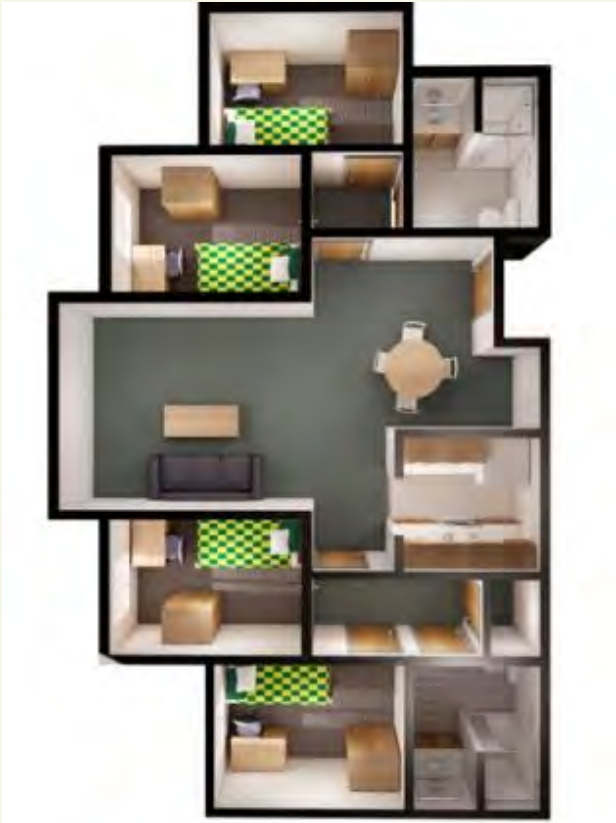
WITHERSPOON HALL APARTMENT 4 PERSON/4 BED