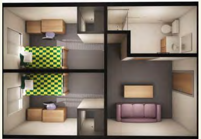
WALLIS HALL SUITE 2 PERSON/2 BED